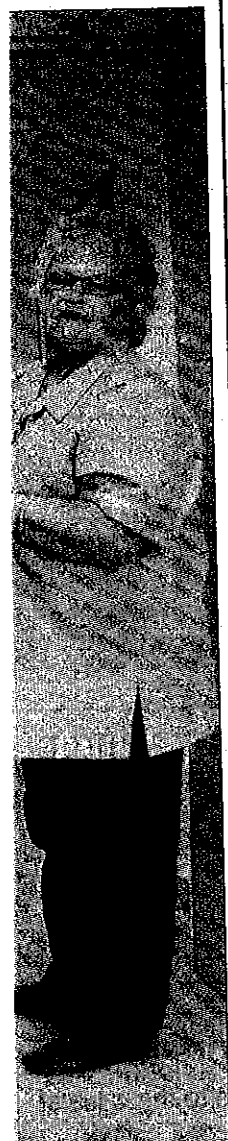
er and Districts Jenny Teakle can

The service operates on Mondays and appointments can be made by phoning 8723 0540 on week days between 12pm and 3pm.