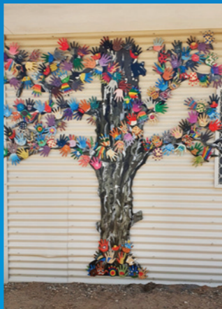
HANDY ARTWORK: The Murray Bridge Showgrounds parents room features a colourful and creative mural that involved children from across the Murraylands.

The art is another addition to murals CFC has engaged children to design in the region over the years, including one at Murray Bridge High School and another at Tailem Bend Hospital.