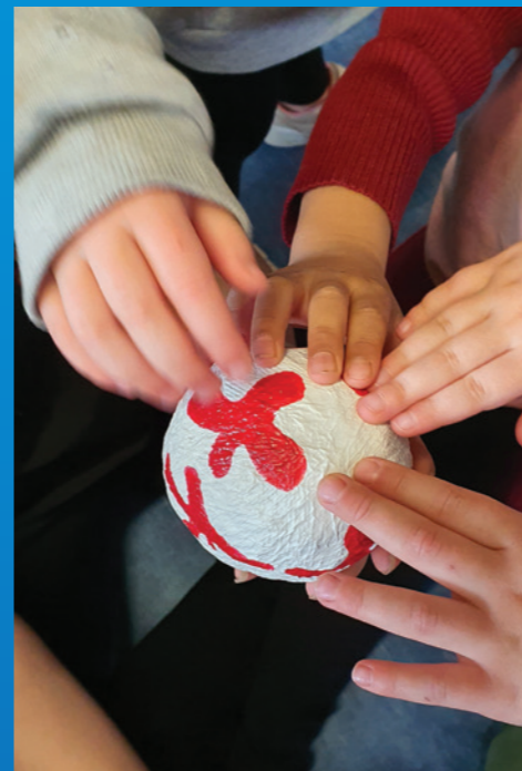
CALLING ON COMMUNITY: Children sing, read, and talk to the egg to help it grow.

Education and Local Government Association of South Australia. ac.care partnered with Murray